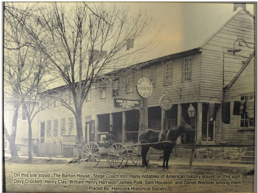
On this site stood "The Barton House" Stage Coach Inn; many notables of American history stayed on this spot; Davy Crockett, Henry Clay, William Henry Harrison, James Polk, Sam Houston, and Daniel Webster among them. Placed By: Hancock Historical Society

The adjacent photograph is from the Hancock Historical Society collection. The Barton House was located at now 42 West Main Street, the site of the Hancock Visitor’s Center.