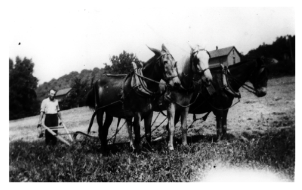
Dick Winters plowing.