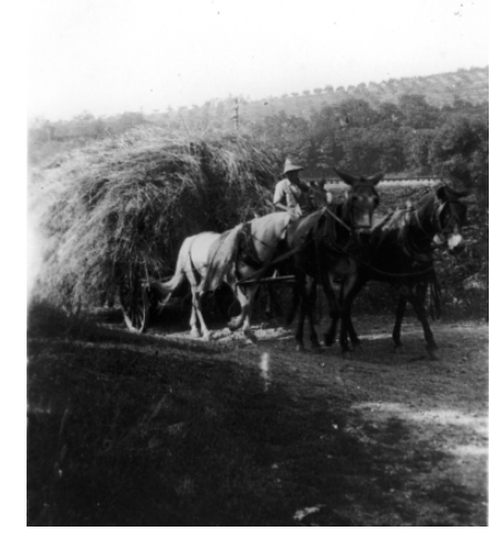
Dick Winters bringing in a load of hay to the barn.