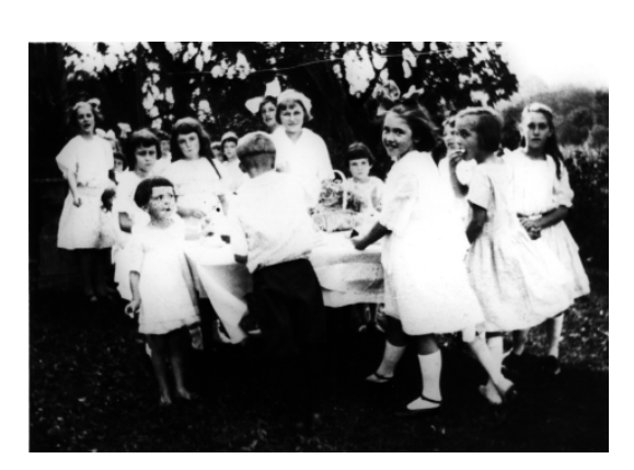
"Pink and White" Tea party