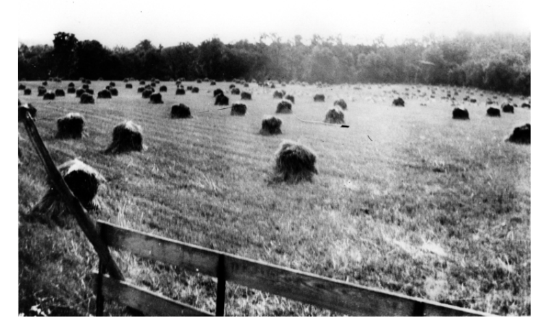
Wheat in field in bundles