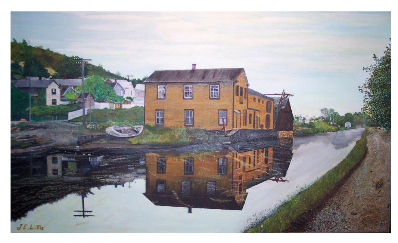
The Mitchell and Norton canal boat yard was, in the above painting, to the left foreground.<sup>53</sup> The store backed up to the canal, so a canaller would see the back of the store.

The original building` was used to store fur pelts sold and traded by Indians and early settlers before the canal opened. Mr. Jean Little stated that furs were longboated on the Potomac River from the original structure. The adjacent photograph