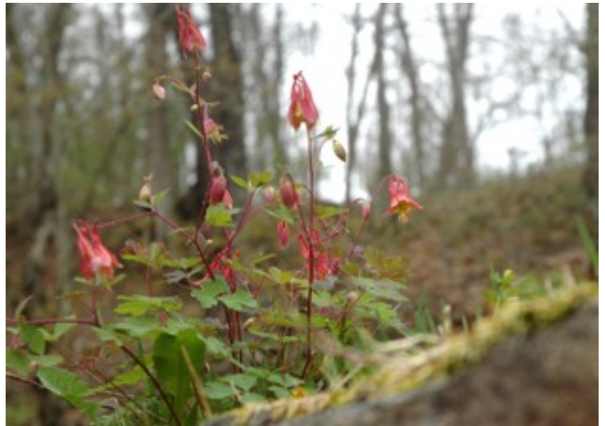
Wild Columbine, Aquilegia canadensis . Milepost 146.5. JH