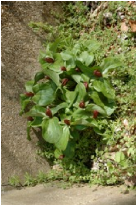
Sessile Trillium or Toadshade, Trillium sessile . Often found in a bunch like this - near milepost 147. JH