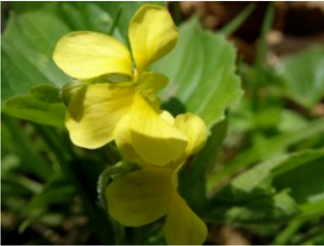
Yellow violet, Also milepost 118. There are many violets and it is hard to identify this one without being there. My guess is the Smooth Yellow Violet, Viola pennsylvanica , but it could be the Downy Yellow ( Viola pubescens ). MR