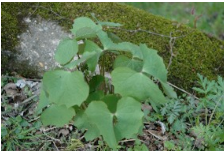
Jefferson Twinleaf, Jeffersonia diphylla. Taken near milepost 145. Don't know if it has bloomed already or if it will do so soon.