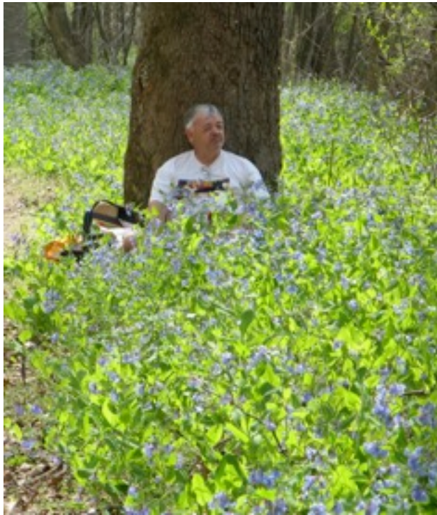
Bluebells! Everywhere! Hiker resting near milepost 105. FW

Garlic Mustard, Alliaria officinalis . (non native) This invasive plant is found everywhere. Probably introduced to the US in early 1800's by European settlers as a food. It inhibits the growth of many native plants and threatens several butterfly species because, while butterflies may lay their eggs on it, the larvae fail to survive due to the chemistry of the leaves. This photo at milepost 102. JW