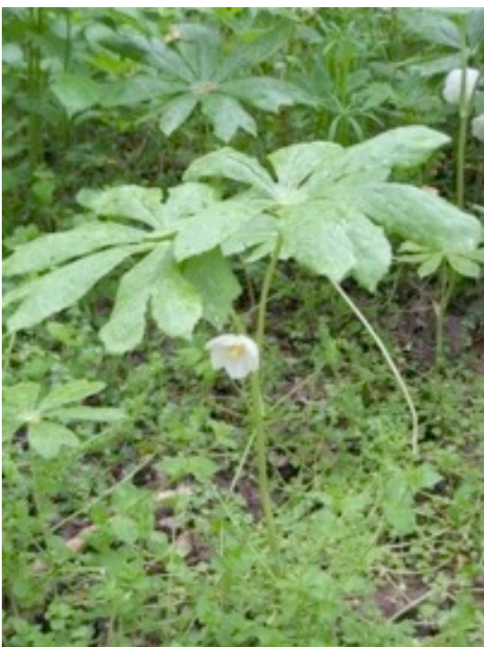
Mayapple, Podophyllum peltatum . Near milepost 50 below Lander. This flower forms luxuriant stands in late April and early May. PH