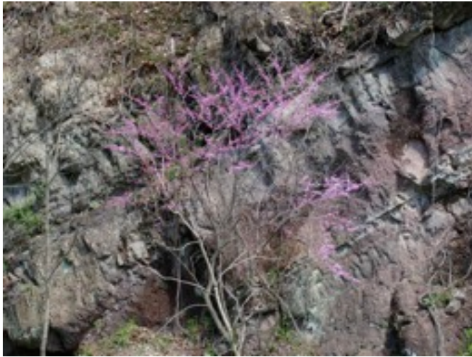
Redbud, Cercis canadensis Small tree just coming into bloom. Milepost 126. JW

Blue Violet, I'll guess at Common Blue ( Viola papilionacea ) or Early Blue ( Viola palmata ). It was taken near milepost 118. MR