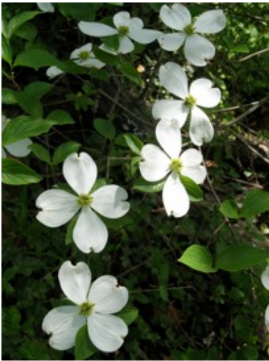
Dogwood, Cornus florida . Near milepost 59. This familiar small tree grows wild along the towpath. FW

Celandine Poppy or Wood Poppy, Stylophorum diphyllum . I have this in my shade garden at home. Taken south of the Catoctin Aqueduct at milepost 51. MOR