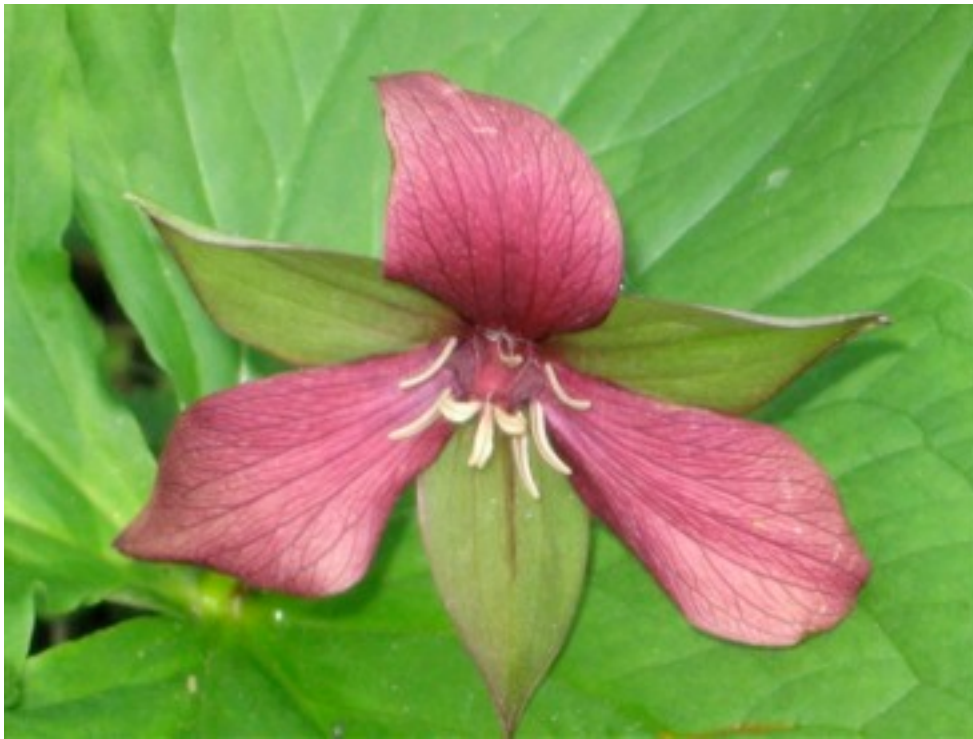
Red Trillium or Wakerobin, Trillium erectum. Taken near milepost 99.

The Virginia bluebells were one of the glories of this hike. For about seven days we saw huge fields of them. Here hikers walk through a “bluebell alley” lining the Towpath on both sides near milepost 97.PH